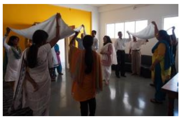
At H V Desai Eye Hospital, Pune