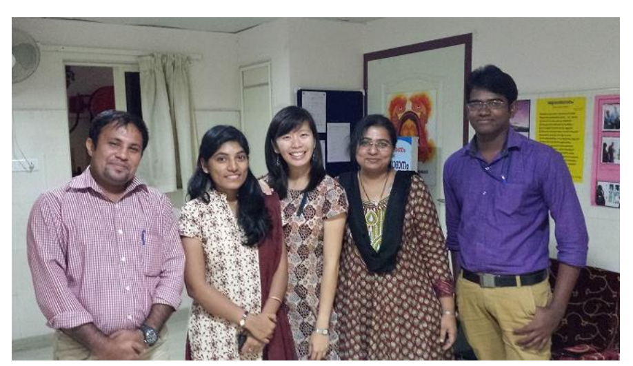
At Eye Bank Association of Kerala