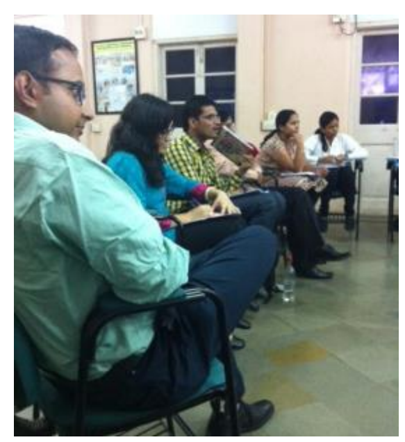
At Eye Bank Coordination and Research Centre