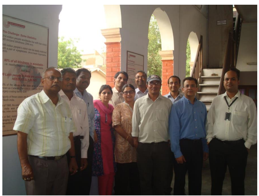
First Eye Bank Managers Retreat was held on June 4, 2012 at Dr. Shroff Charitable Eye Hospital, Daryaganj, New Delhi. 7 managers from all over India attended the workshop (see list above).